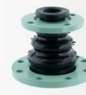
变径橡胶软接头 Variable diameter rubber flexible joint