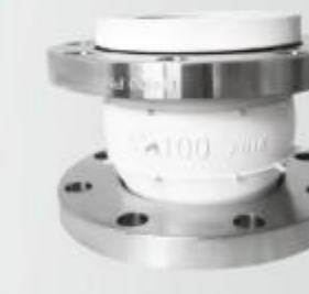
食品级软连接 Food grade soft connector