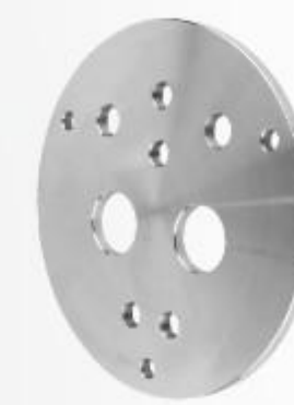
非标法兰 Non-standard flange