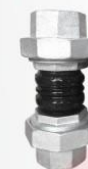
不锈钢丝扣软接 Stainless steel thread soft joint