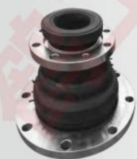
不锈钢变径橡胶软接头 Stainless steel variable diameter rubber flexible joint