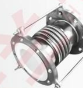
衬氟波纹管 Non-standard flange