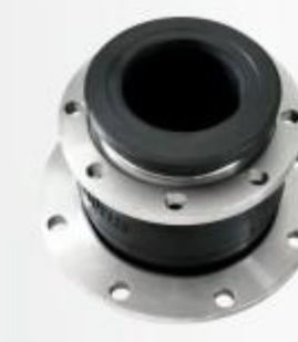
不锈钢变径橡胶软接头 Stainless steel variable diameter rubber flexible joint