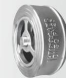
H71不锈钢对夹止回阀 H71 stainless steel clamp check valve