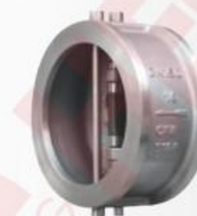
H76W不锈钢对夹止回阀 H76W stainless steel clamp check valve