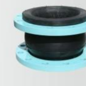
橡胶软接头 Rubber flexible joint