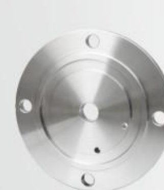
非标法兰 Non-standard flange