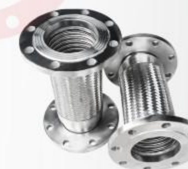
不锈钢金属软管 Stainless steel metal hose