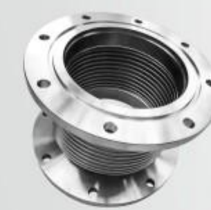
波纹管 Non-standard flange