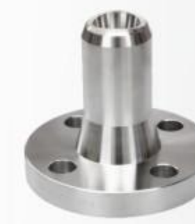
非标法兰 Non-standard flange