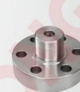
非标法兰 Non-standard flange