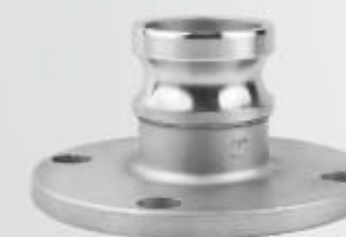
卡压法兰 Clamp flange